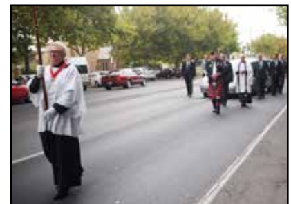
Ex-servicemen formed an honour guard as the hearse left for the cemetery.