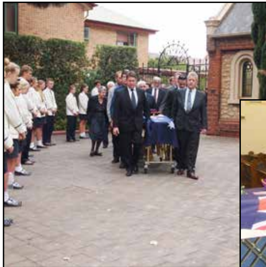
Left: The coffin being moved to the hearse for the committal.