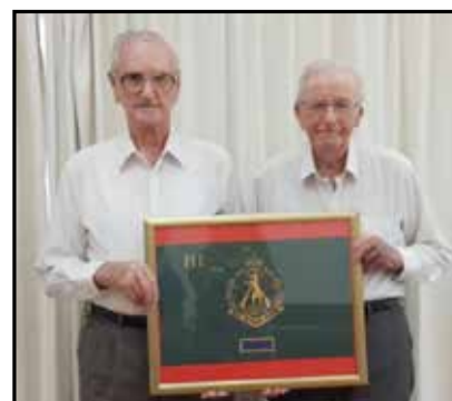
Above: Baptist Care, Gwelup. Below: Pines Aged Care, Ellbrook