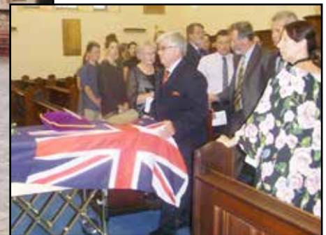
Below: The coffin being wheeled to the waiting pallbearers.