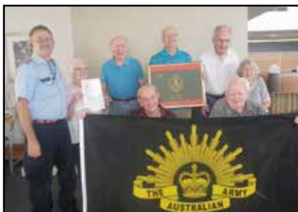
Above: Hermitage Aged Care, Ellenbrook.