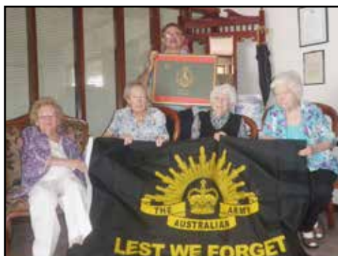
Below: Mt Laverna Retirement Village.

Thank you to the 3 RAR SA Association Incorporated committee for introducing the merchandise range.