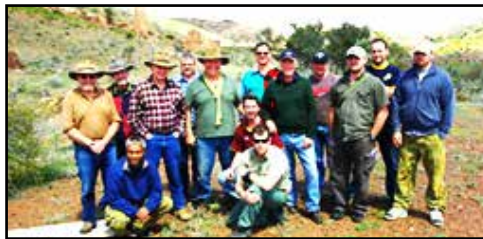
The 2010 crew at Nuccalenna

The High Res app features two major functions: 'Stress Management' helps users manage their immediate reactions to a stressful situation. The app prompts users to test their physical, cognitive, emotional and behavioural reactions and helps them adjust their response with the use of tools on the app. Veterans and Veterans Families Counselling Service (VVCS) and Veterans Line can be reached 24 hours a day across Australia for crisis support and free and confidential counselling. Phone 1800 011 046 (international: +61 8 8241 4546)