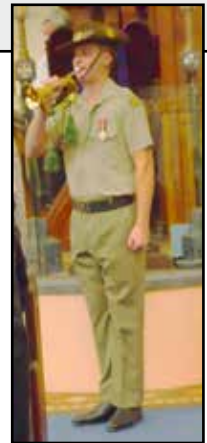
Right: The bugler playing the Last Post.