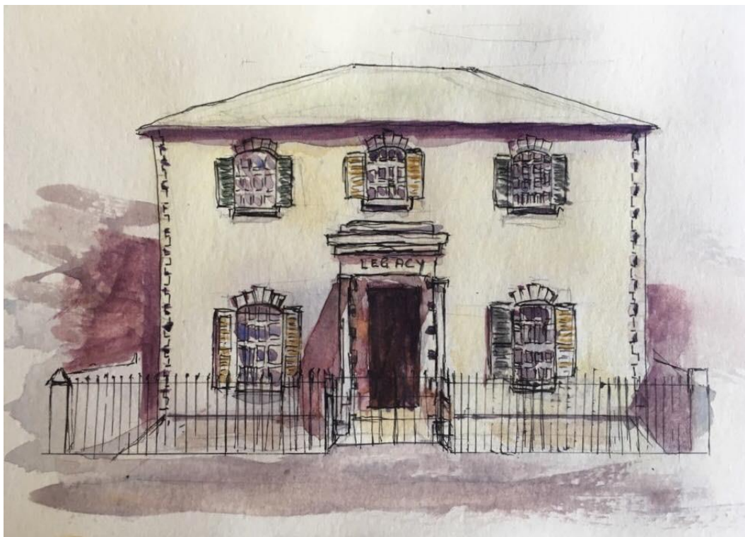
Watercolour sketch by Reservist Army Captain G